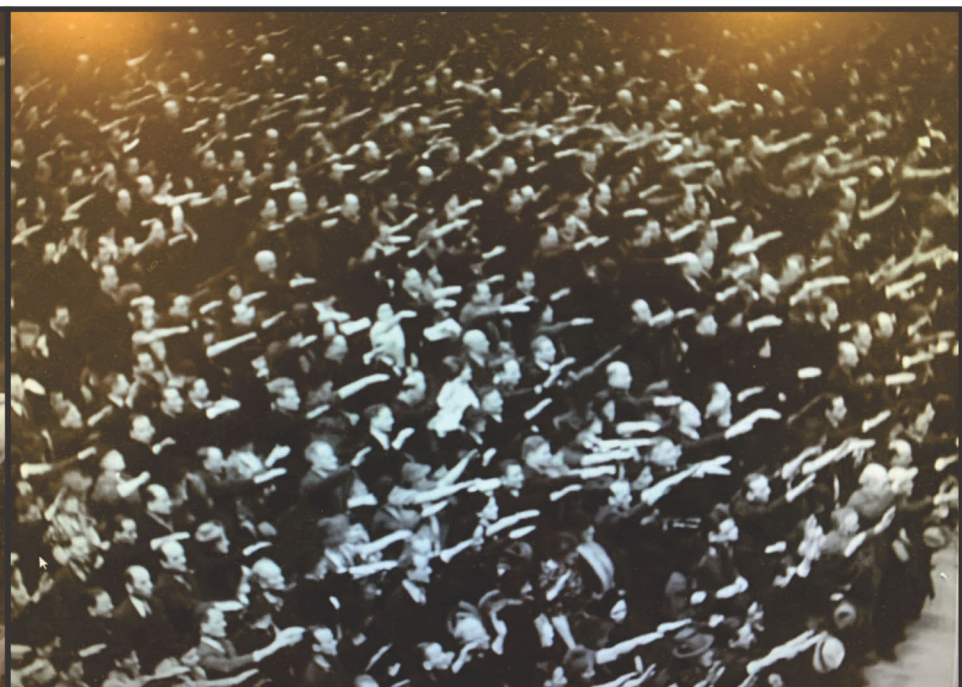
A Night at the Garden, February 20, 1939. 20,000 Americans at Madison Square Garden in New York supporting the Nazis seven months before the Nazis invaded Poland.