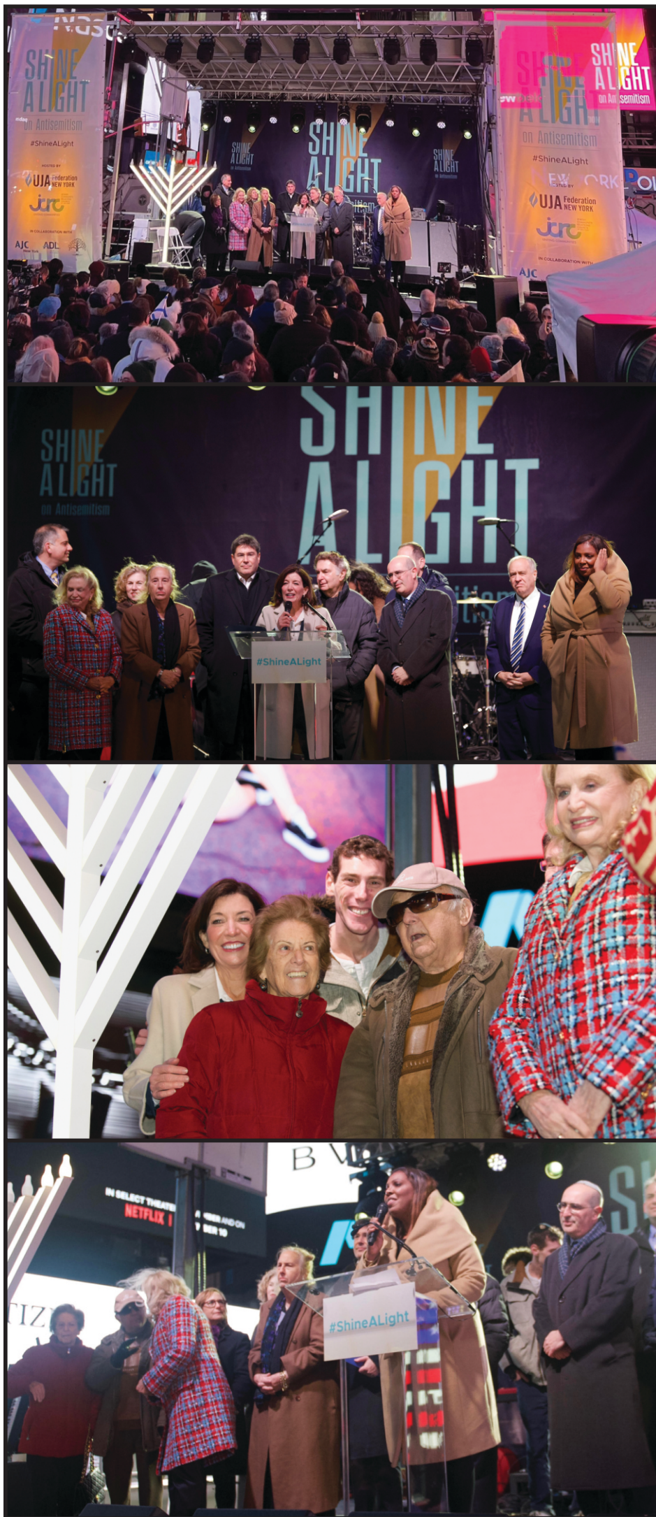
Top: General view of Shine-A-Light Rally at Times Square in NYC. 2nd row: NYS Governor, Kathy Hochul, addressing the thousands who gathered at the Square. 3row: NYS Gov. Kathy Hochul (left) and Congresswoman Caroline Maloney (right) on stage with Holocaust Survivors. Bottom: NYS Attorney General, Letitia James, addressing the audience.